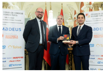
Amadeus (Spanish Company)