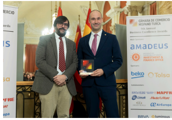
Tosyalı Holding (Turkish Company)